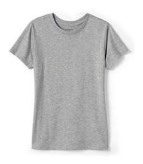
Gray T-Shirt with Lion Logo (available in long sleeve)