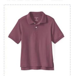
Burgundy Polo with Logo (available in long sleeve)