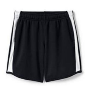
Athletic Shorts with Lion Logo