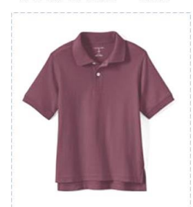
Burgundy Polo with Logo (available in long sleeve)